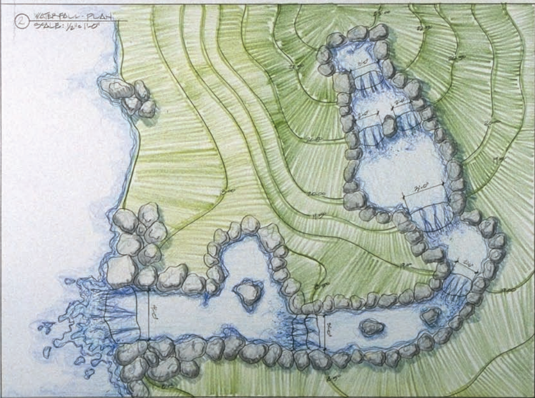
② WATERFALL - PLAN SCALE: 1/8" = 1'-0"